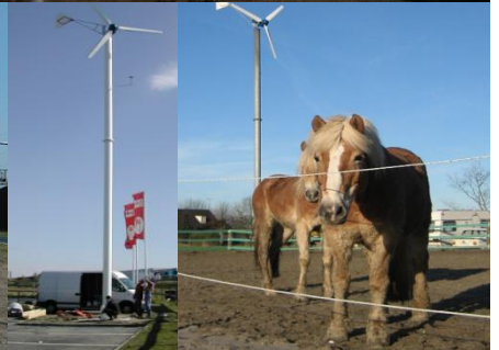
Sport & Recreation industry