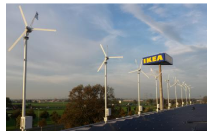
Hybrid on building in The Netherlands