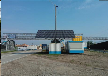
Containerized power supply